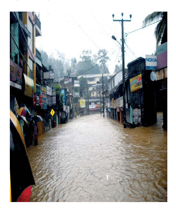
Fig. 2: Flooding Pinga Oya along A9 Road (Dec 17, 2012)

numerous environmental problems. Further, it floods frequently nowadays causing huge economical loss to the inhabitants and blocking the transport along A9 highway (Fig. 2).